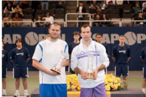
Finalist MARDY FISH & Champion RADEK STEPANEK

No. 5 Radek STEPANEK (CZE) def. No. 4 Mardy Fish (USA) 3-6, 6-4, 6-2