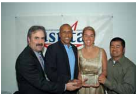
Facility of the Year Olympic Club