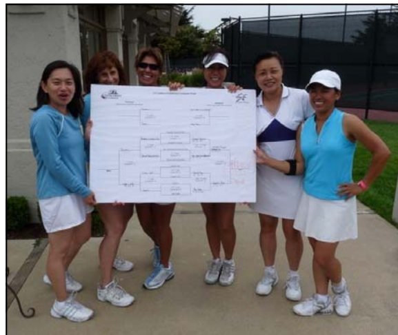
Ladies Invitational 3.5 Champions - ClubSport Fremont