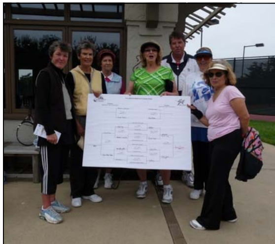
Ladies Invitational 3.0 Champions - Pacific Grove