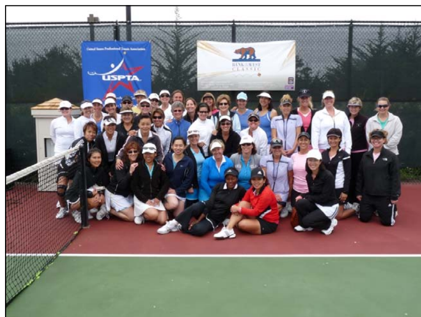
Top: 3.0 teams from Gold River, Pacific Grove, Napa Valley College, Mission Ranch, Spanish Bay and Pasadera Bottom: 3.5 teams from Tiburon Peninsula Club, Bay Trees, Hidden Hills, ClubSport Fremont, Fresno, San Jose Swim & Racquet, Spanish Bay and Pasadera