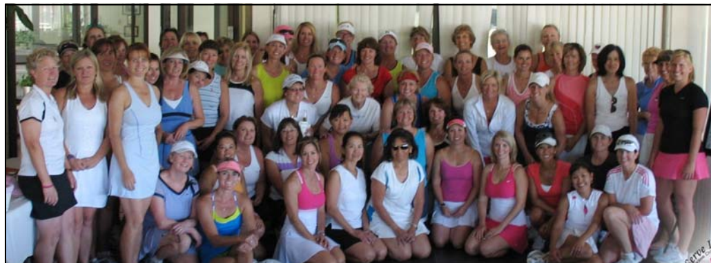
Participants in the Serve It Up Ladies Day at Lakeridge Tennis Club