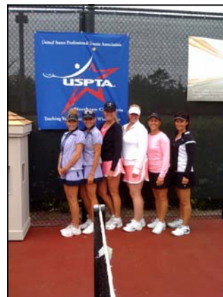
Fresno Team at the Ladies Invitational

Six ladies and one hubby from Sierra Sport and Racquet Club went to the USPTA-Bank of the West sponsored Ladies Invitational Tournament at Spanish Bay the weekend of May 30-31. Saturday was spent shopping at the Gilroy outlets and eating an over-indulgent dinner in Carmel, followed by coffee and sumptuous sweets from Carmel Bakery. We're sure that this pre-game meal is similar to a professional athlete's meal prior to one of the Slams! A lot of thought was put into food and beverage selections!