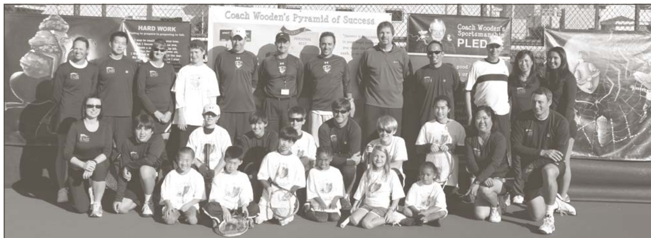
USPTA pros and participants at the Harper for Kids Inch and Miles Sportsmanship Tennis Festival