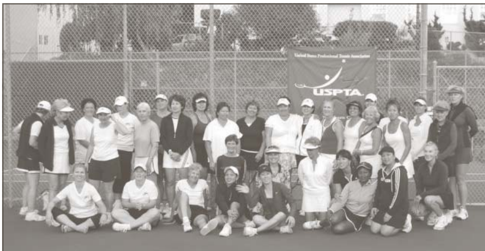
Participants in the second USPTA-Bank of the West Ladies Invitational held at the Claremont Resort in October